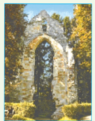
Portal cistercijske crkve